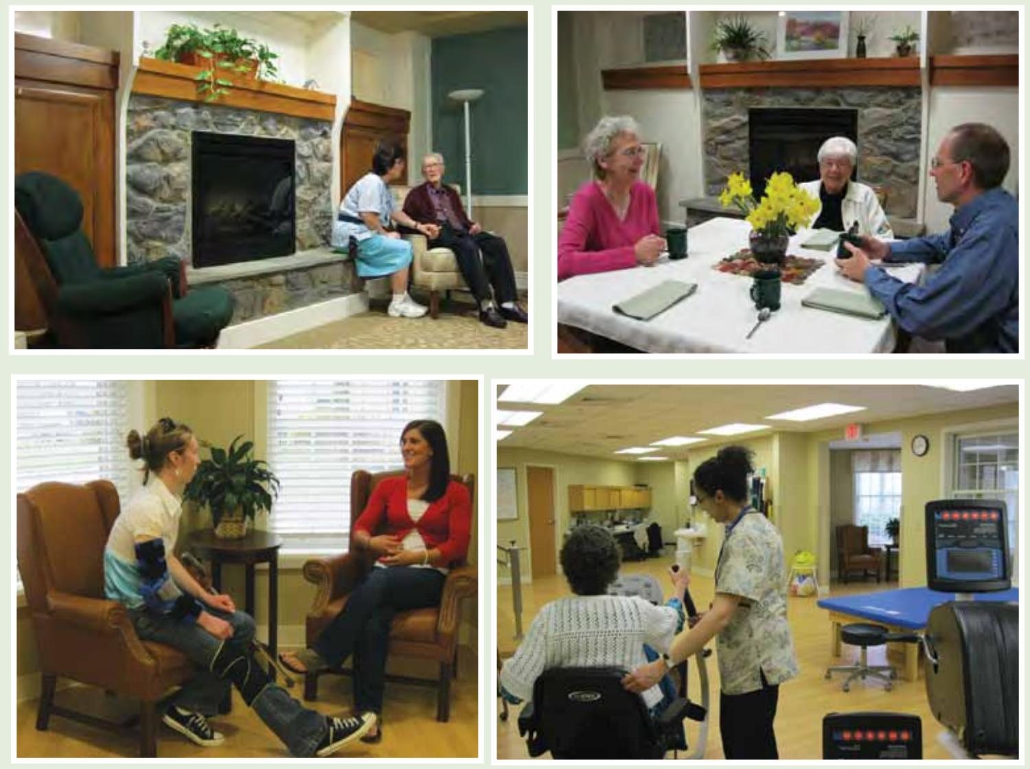
Pictured above, clockwise from the upper left, are various areas in the new rehab neighborhood: lounge, dining room, outpatient entrance waiting area, and therapy gym.