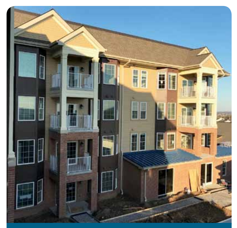
Pictured is a view of the courtyard side of the new Wheat Ridge Apartments. The courtyard will feature a fire pit and bocce court.