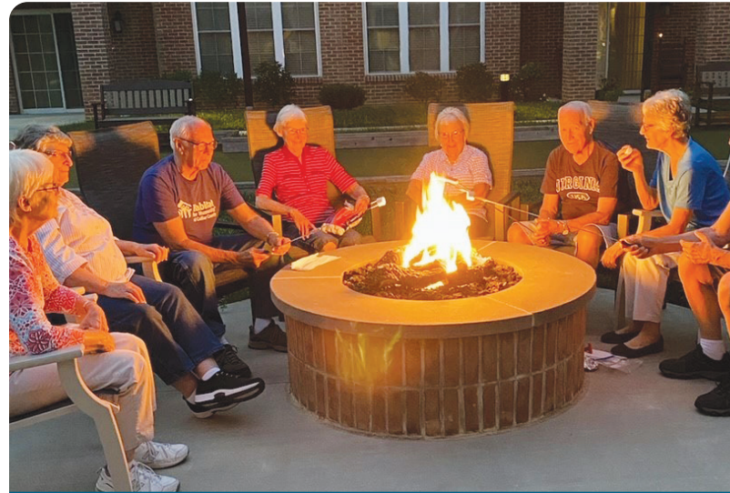
Residents from all over campus gather around the fire pit in the Courtyard, enjoying the company of friends and neighbors.

Every person is divinely designed with physical needs to be met, but thriving depends on meaningful relationships.