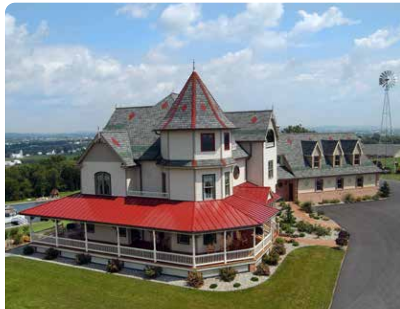
Cider Mill Heights, formerly the Hurst House Bed & Breakfast, now serves as a place of hope and renewal through Stories Made New, a Christian residential discipleship program for women.

By leasing Cider Mill Heights to Stories Made New, Fairmount is supporting a like-minded organization which enriches lives and extends Christ's compassion, sowing seeds of hope, faith and renewal for future generations. However, creating space for Stories Made New is only one of Fairmount's initiatives that creatively serves residents and our community. We want to share two more.