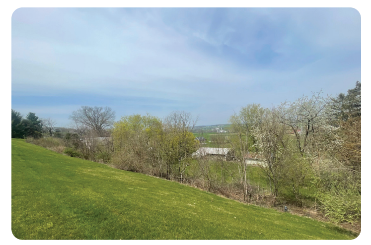
Pre-construction view taken behind 106 Farm Crest Drive, looking along the future path of Orchard Terrace Drive

Exciting news—final approval has been granted for the Orchard Terrace project! EG Stoltzfus will be leading the construction, with groundbreaking expected in May. Interest in this new cottage community has been incredible, with all 16 cottages already reserved! If all goes according to plan, we look forward to welcoming our first residents in early 2026. Stay tuned for updates as this vision becomes a reality.